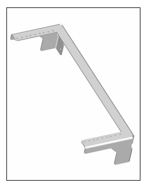
Figure 1. WMB-3U Wall Mount Bracket